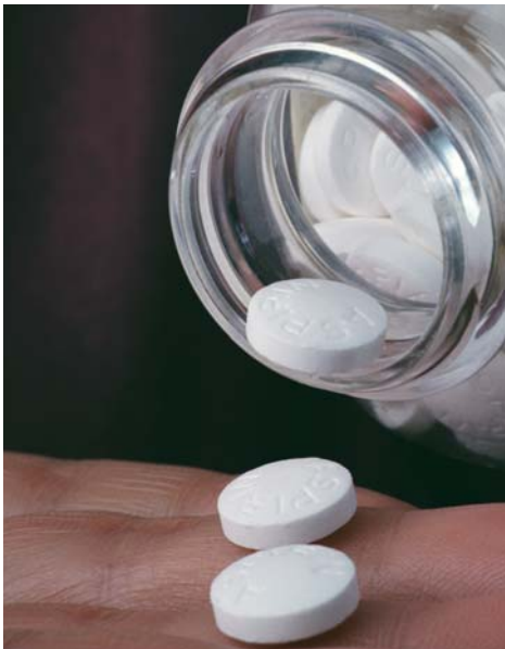
Can a daily dose of aspirin help prevent cardiovascular disease?