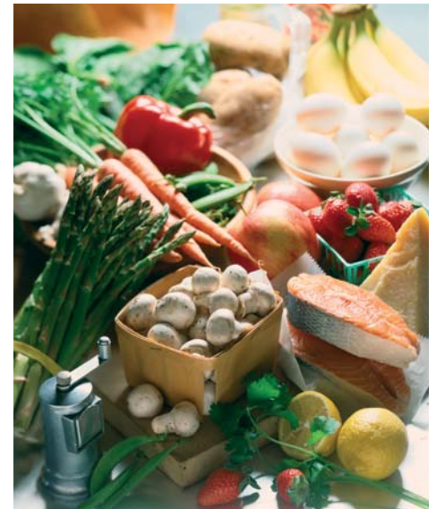
Traditional Mediterranean foods may prevent cardiovascular disease.

The 10 year study involves around 40,000 people, aged 40-69 years, who are participating in the Melbourne Collaborative Cohort Study (Health 2020), run by The Cancer Council Victoria. One quarter of the people on the study are migrants from Italy and Greece. Co-authors of the study include researchers from Monash University, The Cancer Council Victoria, The University of Melbourne, University of Cambridge and St Vincent's Hospital Melbourne.