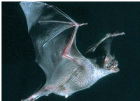
An enzyme in Vampire bat saliva dissolves blood clots

In addition, such improved diagnostic tests will assist in decreasing the costs to the community associated with preventable long-term illness such as heart attack and stroke.